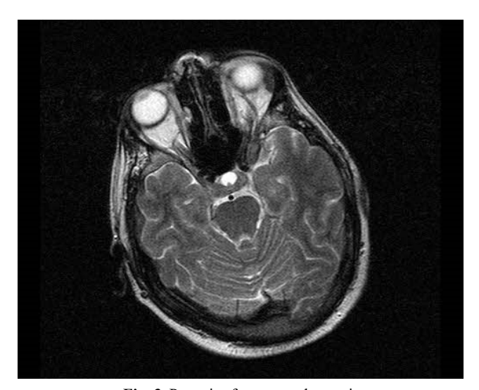
Fig. 3. Posterior fossa toxoplasmosis

imbalance, and multiple skin masses, the diagnosis was posterior fossa toxoplasmosis (Figure 3).