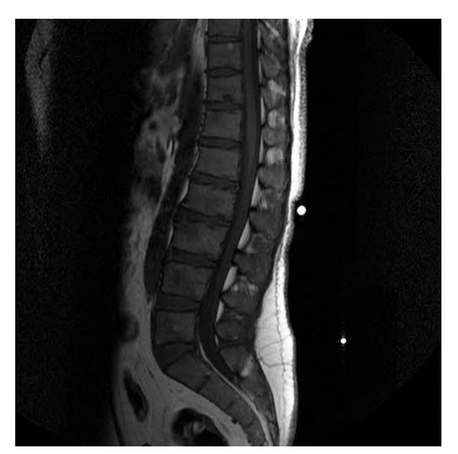
Fig. 2. Multiple lesions at lumbar spine showing sarcoidosis

MRI after steroid therapy. Also the ophthalmic scan was performed and showed no abnormal finding.