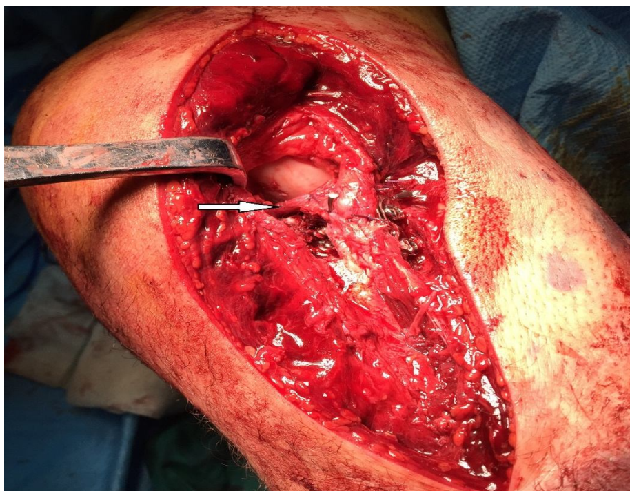
Fig 2B. Tibia bi-condylar plateau fracture and the knee dislocation associated with sever lateral meniscus rupture