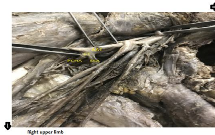
Fig. 3. Showing the right axillary artery was giving a common trunk (CT) dividing into posterior circumflex humeral (PCHA) and subscapular (SSA) arteries.