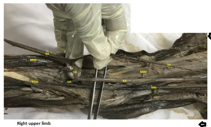
Fig. 2. Demonstrating the; radial artery (RA), brachial artery (BA), ulnar artery (UA), communicating artery (CA), pronator teres muscle (PTM), biceps brachii muscle (BBM) and median nerve (MN).