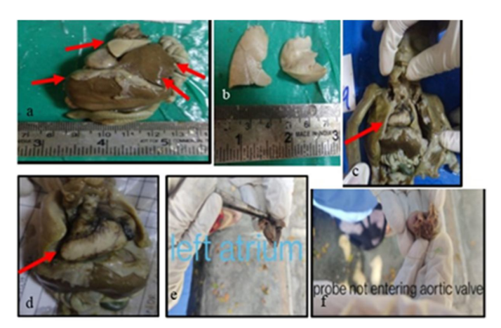
Fig. 2. a. Diaphragmatic hernia, arrows pointing towards diaphragm, intestines, Liver and Lung. b. Hypoplastic Lung. c and d. Dextrocardia, Apex of the heart pointing towards Right. e and f. Hypoplastic left heart syndrome.